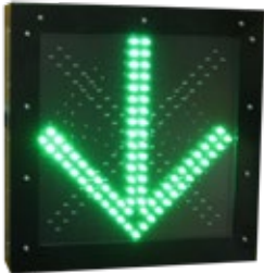
Lane Control LED Sign