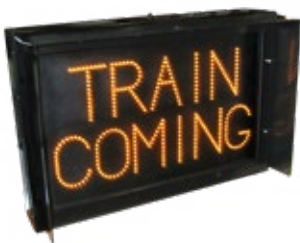
Custom Designs Available