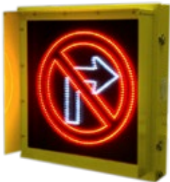
MUTCD LED Sign