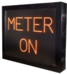
Blank Out LED Sign