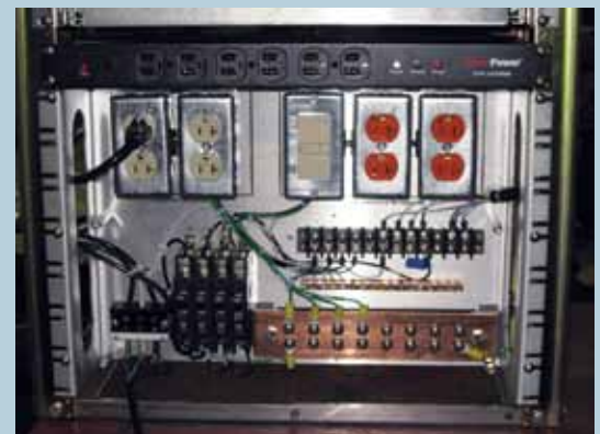
Custom Power Panel