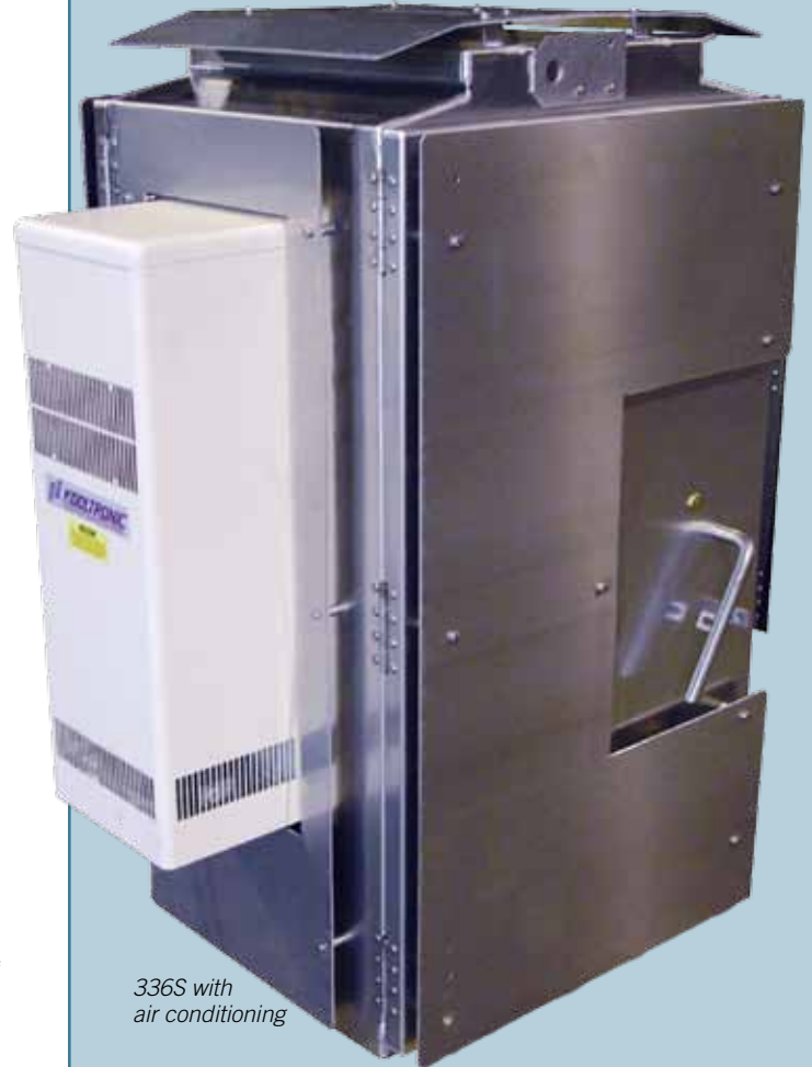
336S with air conditioning

Southern manufactures the enclosures, builds the power panel, and assembles everything in our ISO 9001 registered plant. This gives us a broad array of options to satisfy the most demanding technical requirements. We can even custom design an enclosure around the components that it will house! In addition to high quality cabinets, we provide professional detailed submittal drawings including cut sheets for all of the Southern supplied components. This saves you time, speeds the approval process, and insures that the cabinet that you receive is exactly what you ordered.