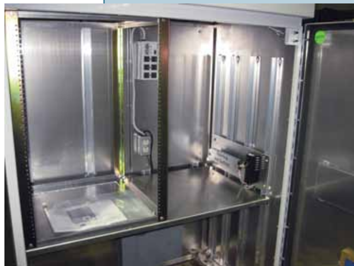
19" EIA rack in a NEMA type IV with unistruts