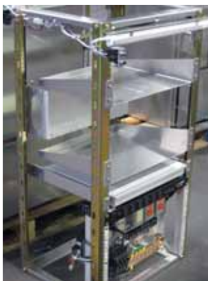
336S EIA Rack with power panel