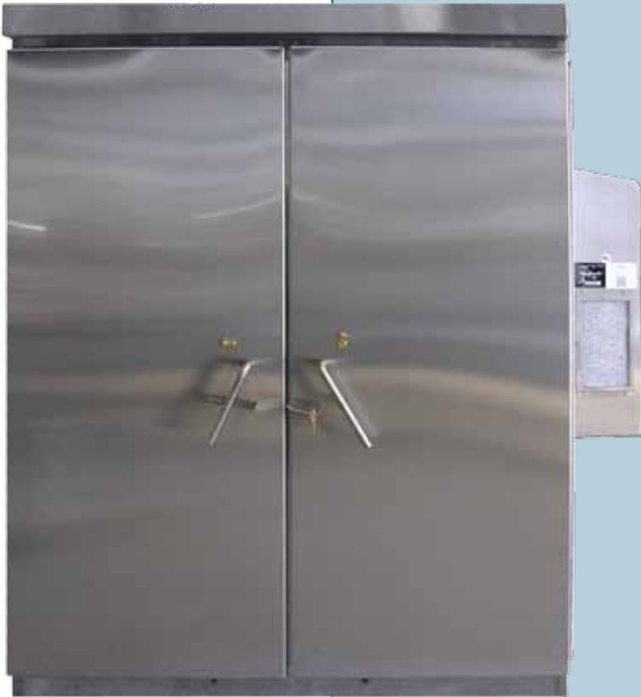
Stainless Quad Door 67" x 72" x 30" Hub with air conditioner